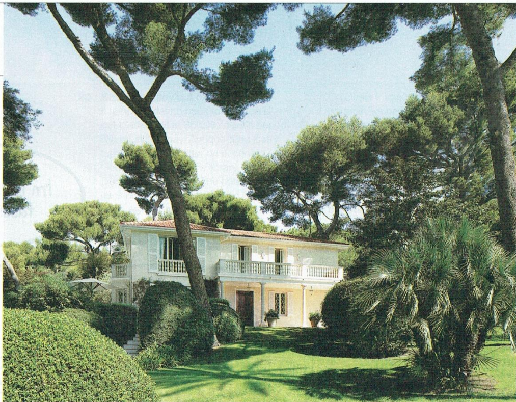
Above Hotel du Cap-Eden- Roc, Côte d'Azur

On a clear day, you can see across to France from Albion House, a retro-chic seaside inn on Ramsgate's East Cliff. Overlooking the Royal Harbour, it's ideal for a blustery weekend in the most stylish of surroundings. Expect excellent food in the Regency dining room and a cocktail bar with a baby grand piano.